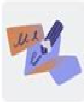
Subject line & preheader generator