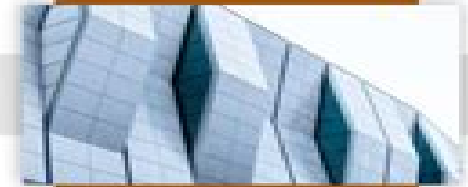
Flip the Script

The Neenan Company is committed to excellence and will help you craft an amazing new building