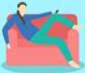
Lack of exercise