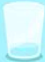
Not drinking enough water