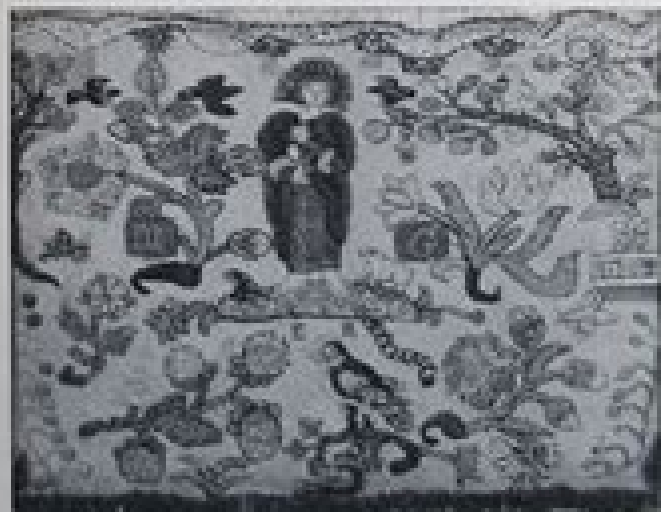
An English pattern, silk and metallic thread on linen, showing a haberd figure as well as the rose and thistle motto. Old Haverbridge Village, photo by James C. Ward.