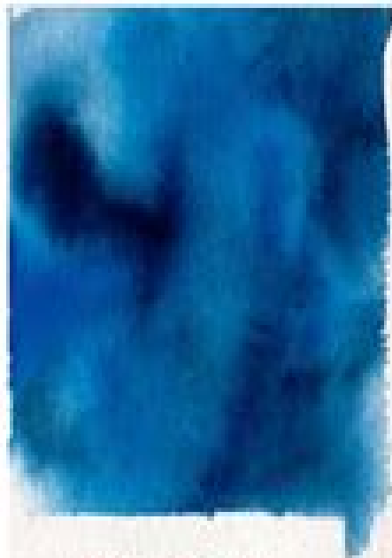
WET INTO WET