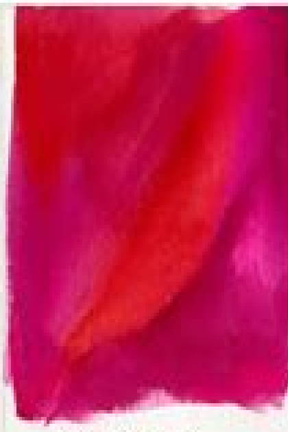
WET ON DRY