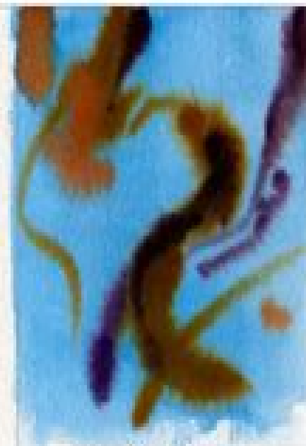
DRY ON WET