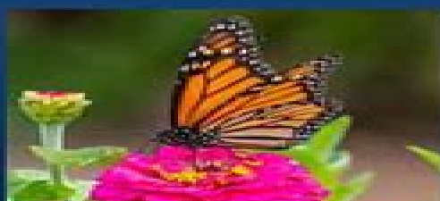
8. MONARCH BUTTERFLY