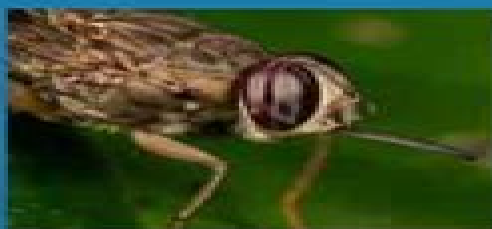
2. TSETSE FLY