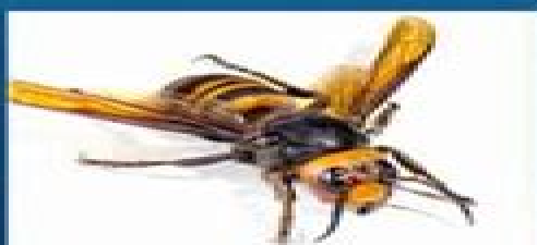
5. WASPS, BEES, ANTS, AND HORNETS