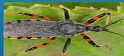
3. KISSING BUG