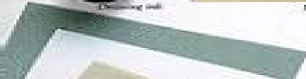
Selection of drawing paper