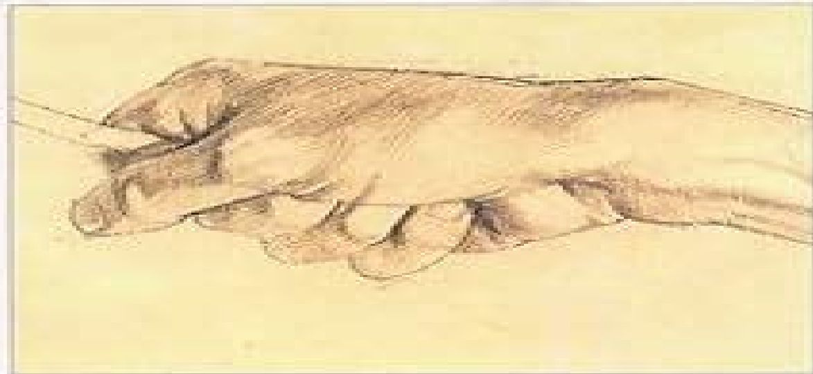
Thomas Bewick, R.A., Study of a Hand for "Apprentice", 1767