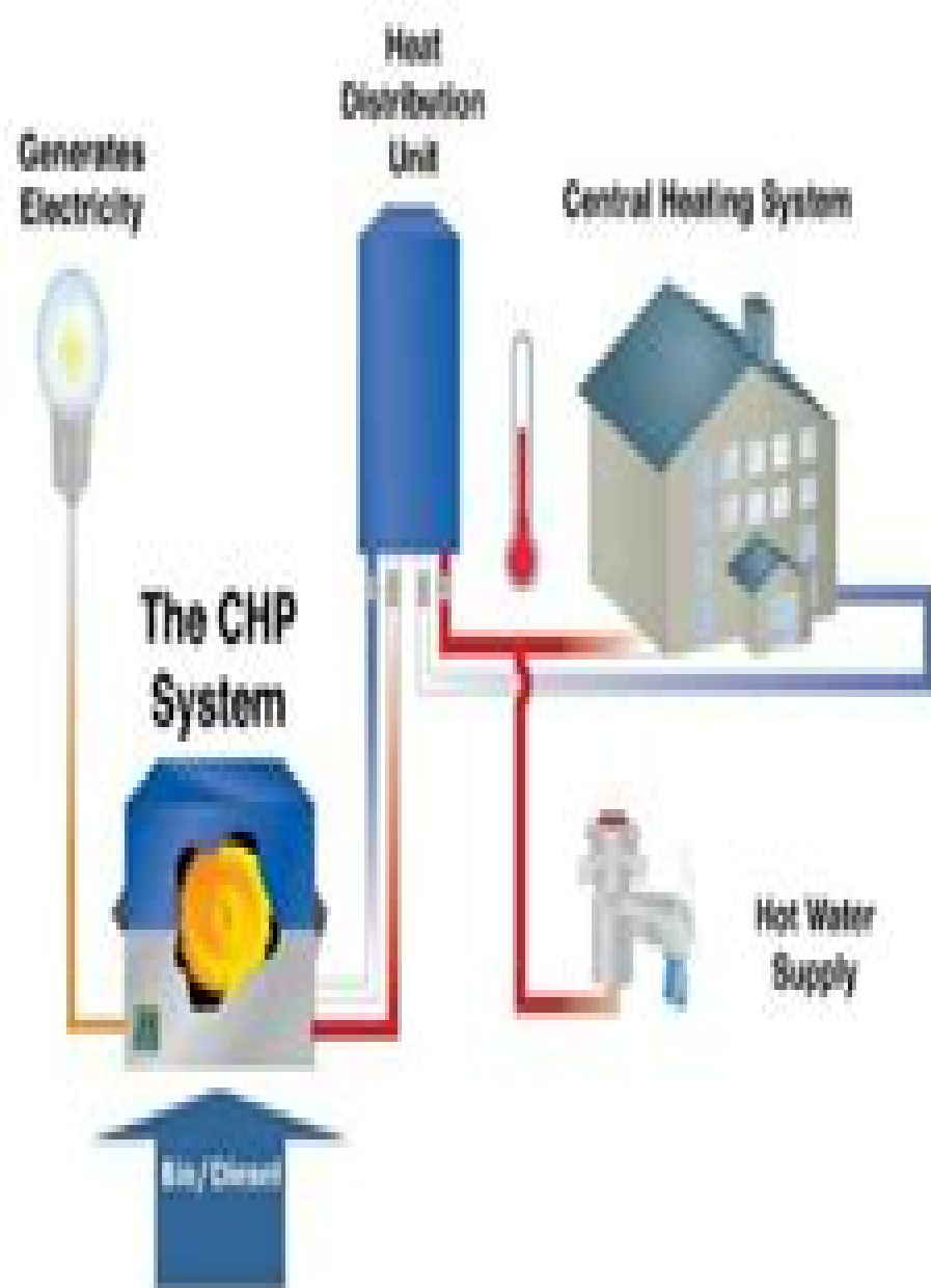
(a) Typical application