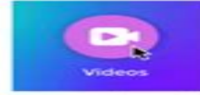
Canva Bkgnd. Remover