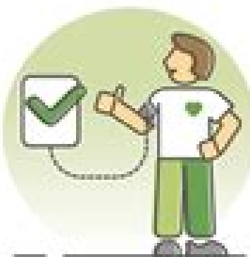
Check Your Blood Pressure