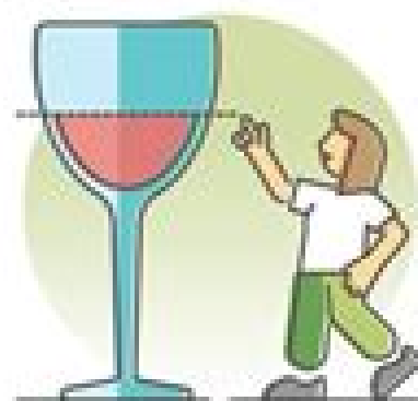
Avoid or Limit Alcohol