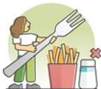
Avoid Salt and Fatty Foods