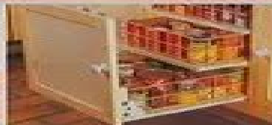
BUYING AND PLANNING