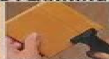
TECHNIQUES, TOOLS AND MATERIALS