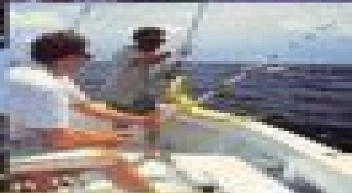
Board of County Commissioners of Polk County, Florida