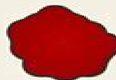
Jelly-like blood clots

Blood mixed with green discharge that could be a sign of BV or trichomoniasis