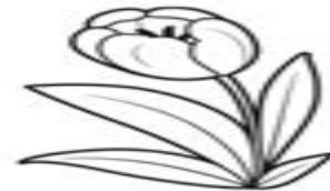
7. Sticker by Number.