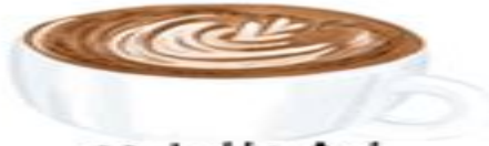
23. Latte Art.