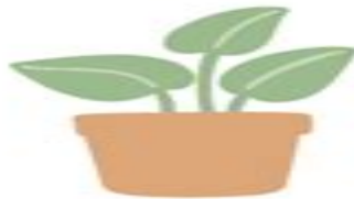
20. Herb Gardening.