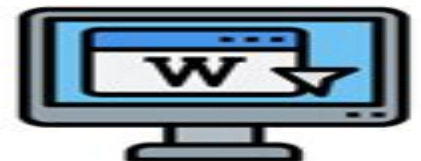
22. Wikipedia Deep Dive.