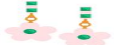
8. Making jewelry.