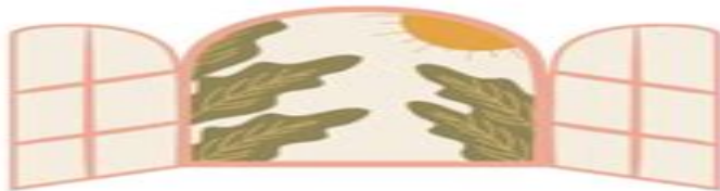
13. Mindfulness Meditation.