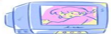
18. TV Series.