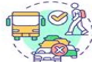
Ease of Movement