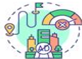
Building at Human Scale