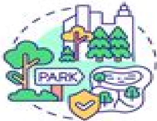
Blue Green Cities