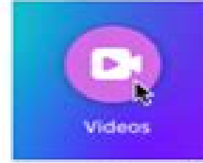
Canva Bkgrnd. Remover