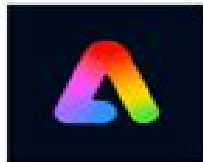
Adobe Bkgrnd. Remove