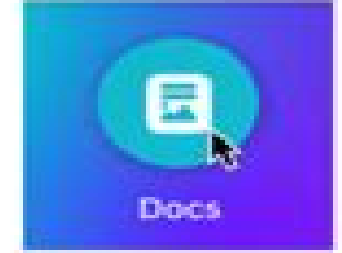
Canva Magic Write