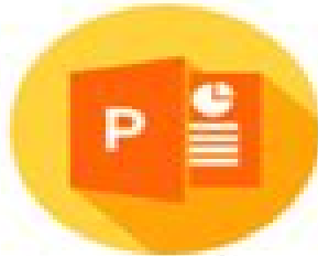
PowerPoint Spkr. Coach