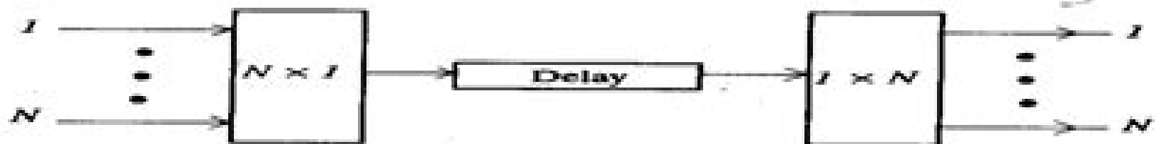
(b) Equivalent circuit.