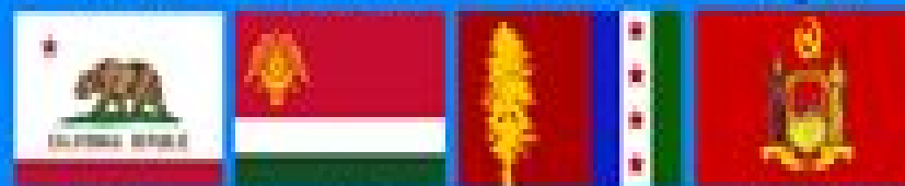
California New Mexico Cascadia New York