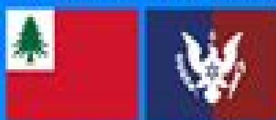
New England Republic of America