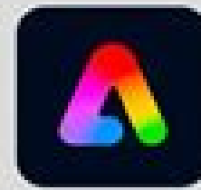
Adobe Express & Firefly