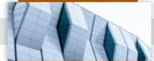
Flip the Script

The Neenan Company is committed to excellence and will help you craft an amazing new building