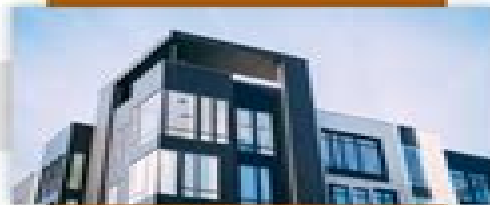
Have Some Flair