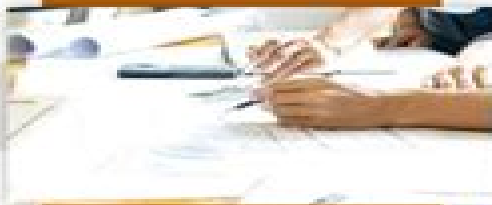
Commit to Problem Solving