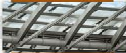
Make Use of New Technologies

Move forward with your project by looking backward at previous experts