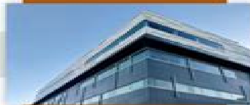
Be True to Your Principles