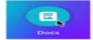
Canva Magic Write