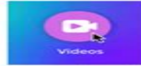
Canva Bkgnd. Remover