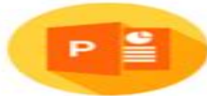
PowerPoint Spkr. Coach