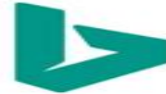
Bing Image Creator