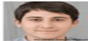
Random Face Generator