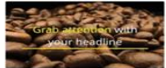
Fun Coffee Facts