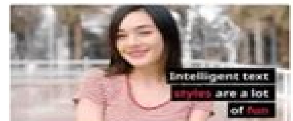
Summer Travel Content