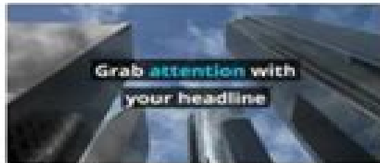
General Business Video