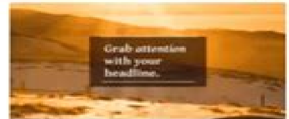
Upbeat Motivational Video