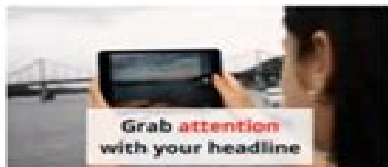
Informational Technology Video