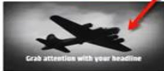
Interesting Historical Facts