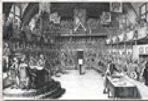
LEGISLATIVE ASSEMBLY FRENCH REVOLUTION SEPTEMBER 1791 ALL ENEMIES OF LIBERTY