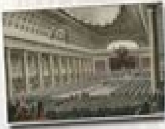
NATIONAL ASSEMBLY FRENCH REVOLUTION JUNE 17, 1789 TOWARD LIBERTY