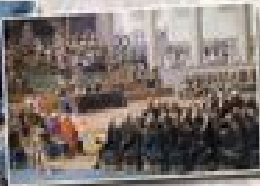
ESTATES GENERAL FRENCH REVOLUTION MAY 5, 1789 ALL THREE ESTATES