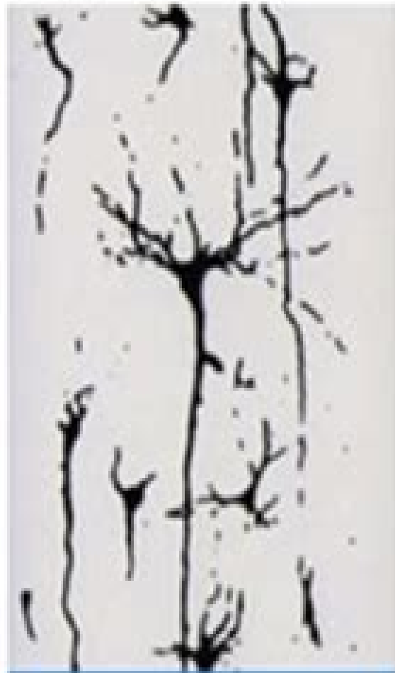
Figure 1: The pruning trajectory of brain synapses