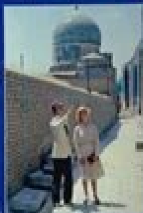
Prinsessan till Sovjet, Moskva 1974