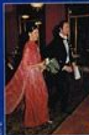
Prinsessan till Sovjet, Moskva 1974