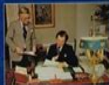
Kung Carl Gustaf och kronprinsessan Margareta i salen, Stockholm, april 1977