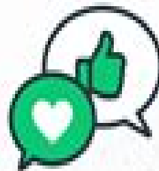
Social media manager