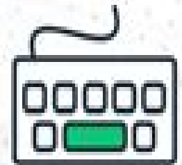
Data entry specialist