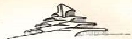
Abb. 12. Deutsches Reich in Bonn, 1938.

Die Kunst und die Nation (Friedrich Schlegel in Bonn, 1808). Die Kunst ist die Nation, die Nation ist die Kunst. Die Kunst ist die Nation, die Nation ist die Kunst. Die Kunst ist die Nation, die Nation ist die Kunst. Die Kunst ist die Nation, die Nation ist die Kunst. Die Kunst ist die Nation, die Nation ist die Kunst.