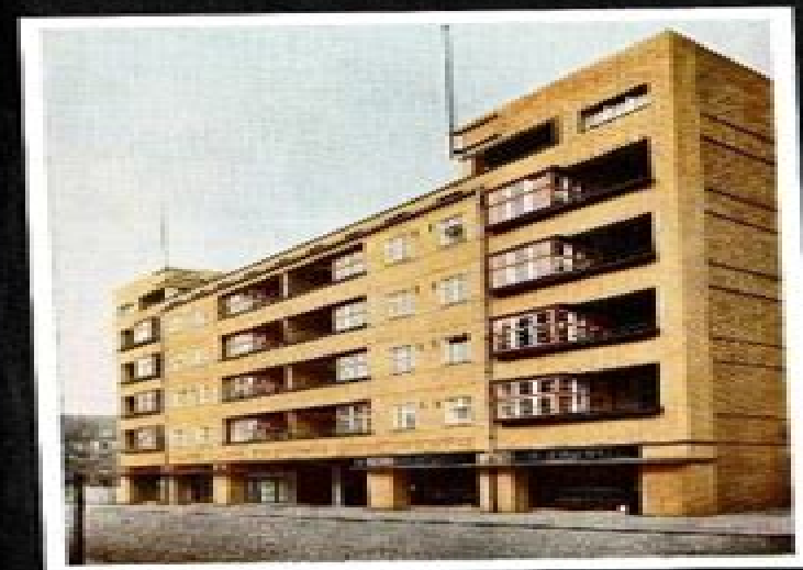
Abb. 10. Umbauversion des Deutschen Reichs in Bonn, 1938. (Von Hans Scharoun, Architekturbüro Scharoun & Partner)