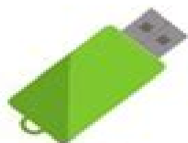
une clé USB