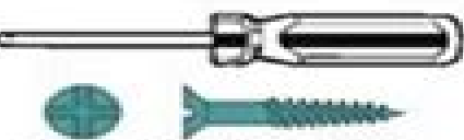
phillips head screwdriver