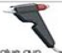
hot melt glue gun