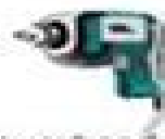
power hand drill