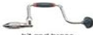
bit and brace